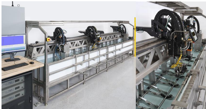
Figure # 2: Immersion Ultrasonic Test Unit, Banner Medical Carol Stream, IL

Banner Medical has installed and commissioned a state of the art Ultrasonic Testing unit in our Carol Stream, IL facility. We elected to acquire this highly sophisticated piece of equipment for two reasons: 1) to provide our customers the ability to cost effectively and readily comply with industry wide and customer specific requirements, and 2) to give customers the ability to design a process which mitigates risk in their operations. Figure 2 depicts our UT equipment installed and commissioned: