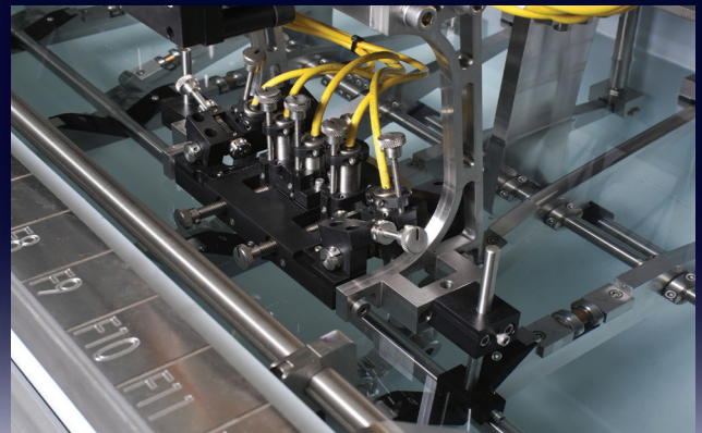
MULTI-AXIS SCANNING HEAD ENCOMPASSES 5 TRANSDUCERS